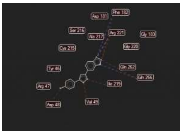
FIG. 2: INTERACTION OF COMPOUND IIE WITH BINDING SITES OF RECEPTOR PTP1B RECEPTOR (PDB ID: 1Q1M)